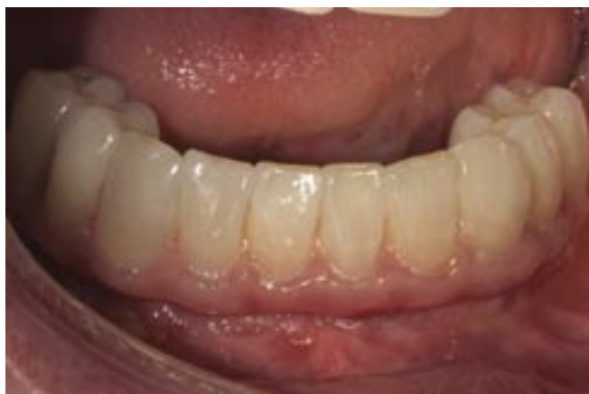
Fig. 19: Front view (final)

The various prosthetic protocols were carried out for try-ins and establishing a proper plane of occlusion and the fixed bridge was screw retained. Excellent exit of the screw holes in the prosthesis was achieved, through planning, clinician-lab communication and also with stereo lithography stents that would allow the trajectory to be at the center of the cingulum of the implants. The case was extremely successful and the patient was pleased. Oral hygiene instructions were given to the patient. It is noted that on one of the photographs, he has a maxillary temporary denture only on several teeth. Phase II of this treatment will be to remove the remaining maxillary teeth and establish the same protocol of implant placement on the maxillary arch. The patient is in treatment for the maxillary arch and the part two would be to show the completed case with the maxillary reconstruction. ■