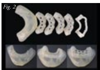
Fig. 2: Stereo lithography and bone reduction guide