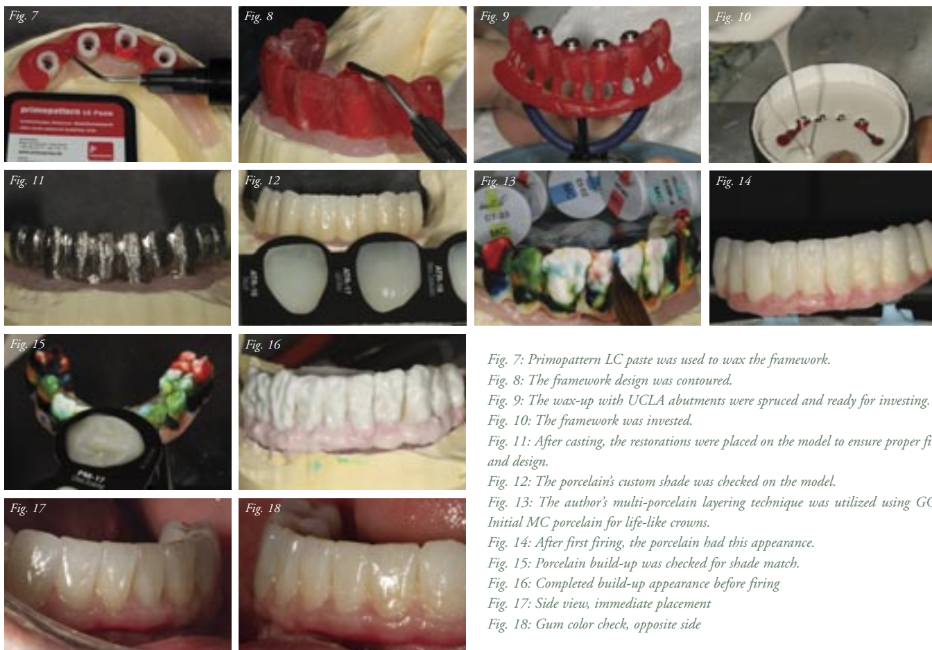
Fig. 7: Primopattern LC paste was used to wax the framework.

These modifications were applied based on the author's impression of the patient's existing dentition and his applied